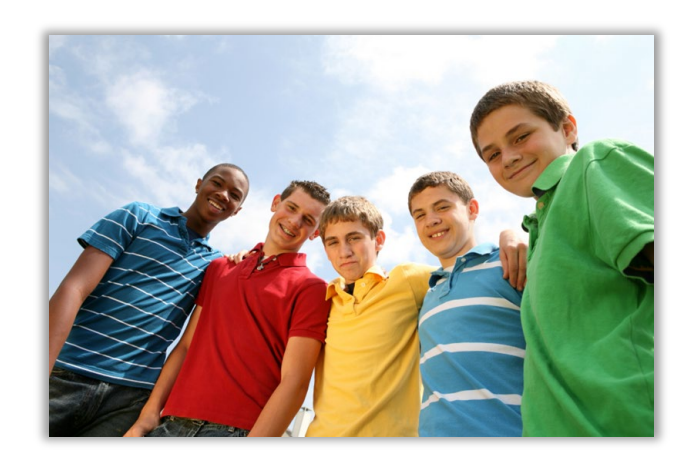
For more information about the WiseGuyz program, please visit our <u>website</u>

The Centre for Sexuality is committed to providing parents and guardians with evidence-informed information and practical tools to support their adolescent children in making healthy decisions about their sexuality. Within the WiseGuys program there is an opportunity for two evening workshops (online /or in-person), where parents can learn more about the WiseGuyz curriculum to support their teenager's healthy development. Details on evening workshops will be shared with parents and guardians at least one month in advance.